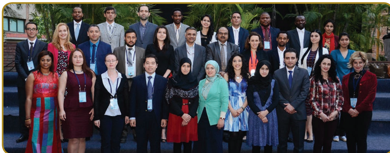
Participants of the RIS-ITEC Capacity Building Programme on International Economic Issues and Development Policy (IEIDP) with RIS Faculty.