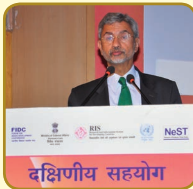
Dr. S. Jaishankar, Foreign Secretary delivering the valedictory address.

Dr. S. Jaishankar, Foreign Secretary of India delivering valedictory address at RIS conference on SSC highlighted the vital role that India is playing in reshaping the global agenda on South-South Cooperation. He mentioned that India is always willing to share its limited resources with other developing countries and take it as a responsibility to assist developing countries in building their capacity. For this, India in its present union budget has