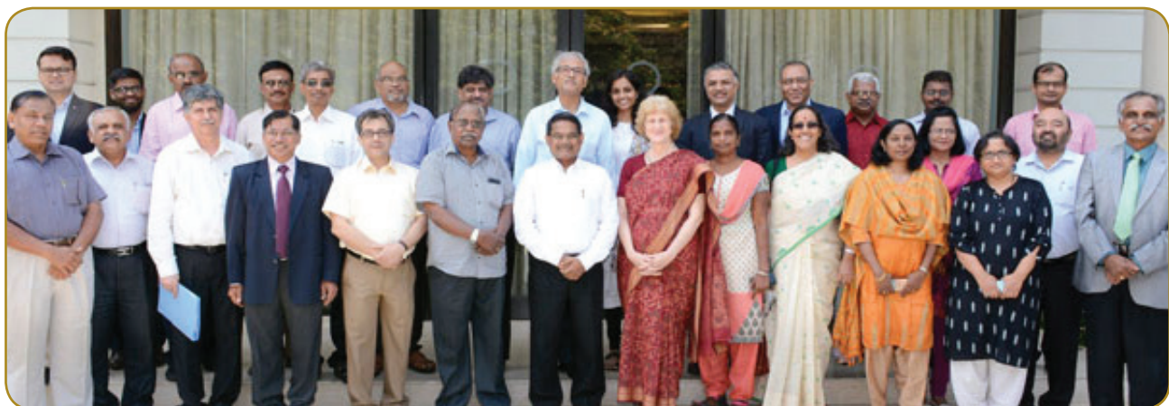
Participants of FIDC Regional Consultation at Chennai.