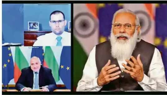
The India-EU Connectivity Partnership Initiative is seen as one of the key outcomes of the India-Europe Leaders' Summit held virtually on 8 May.ptf

2 min read . Updated: 16 May 2021, 11:13 PM IST