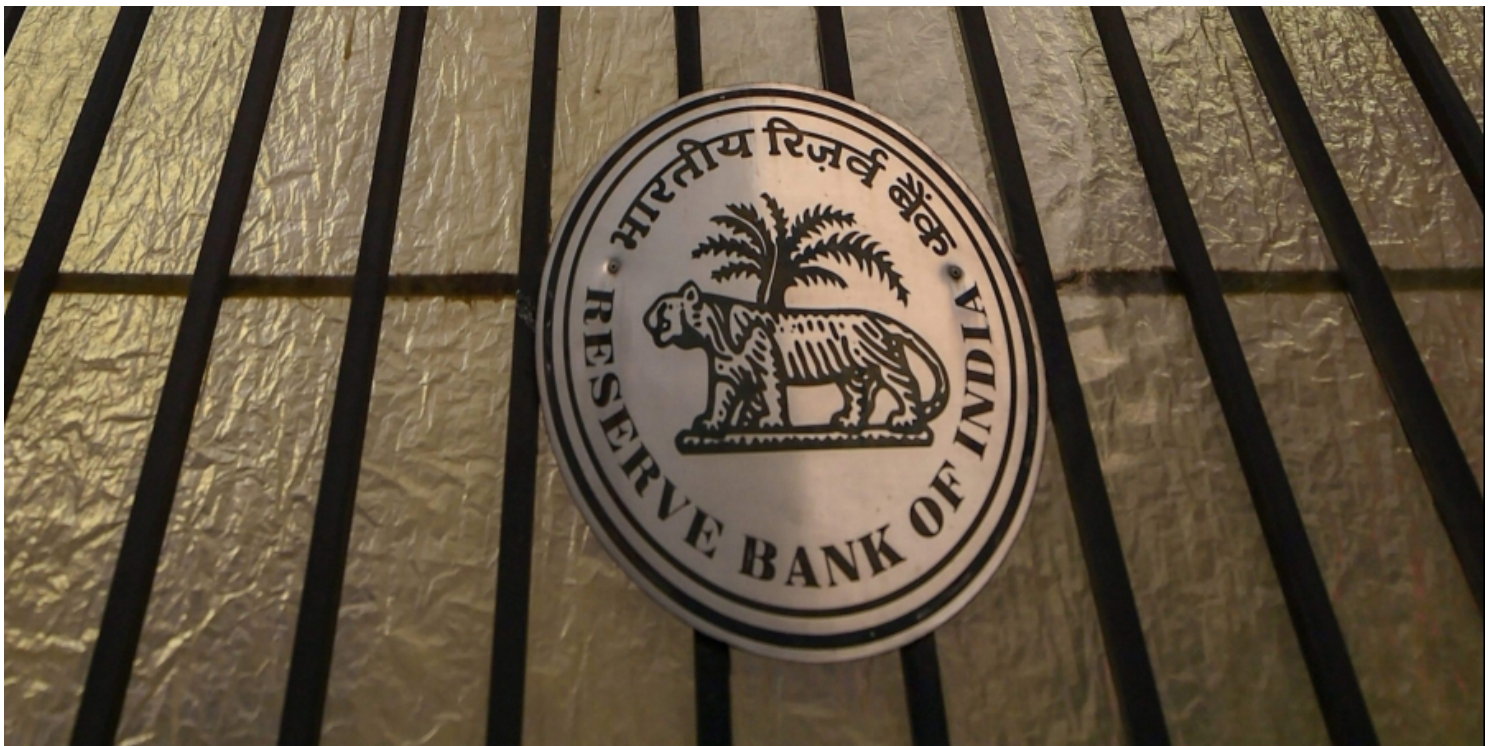
Reserve Bank of India