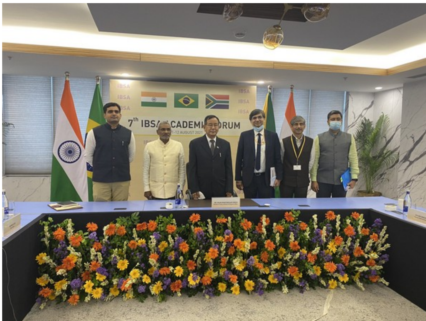
MOS inaugurates two-day 7th IBSA Academic Forum.