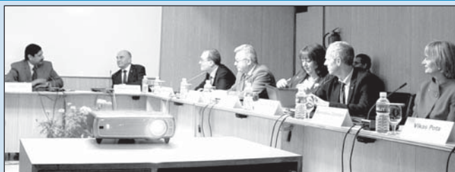
Hon'ble Mr. Stephen Pound and members of the delegation at RIS.

A delegation of 6 UK 'Labour Friends of India' (LFIN) MPs from the Labour Party visited RIS on 14 February 2008. The delegation included; Mr. Stephen Pound, Chairman, LFIN; Dr. Stephen Ladyman; Mr. Denis Murphy; Ms.