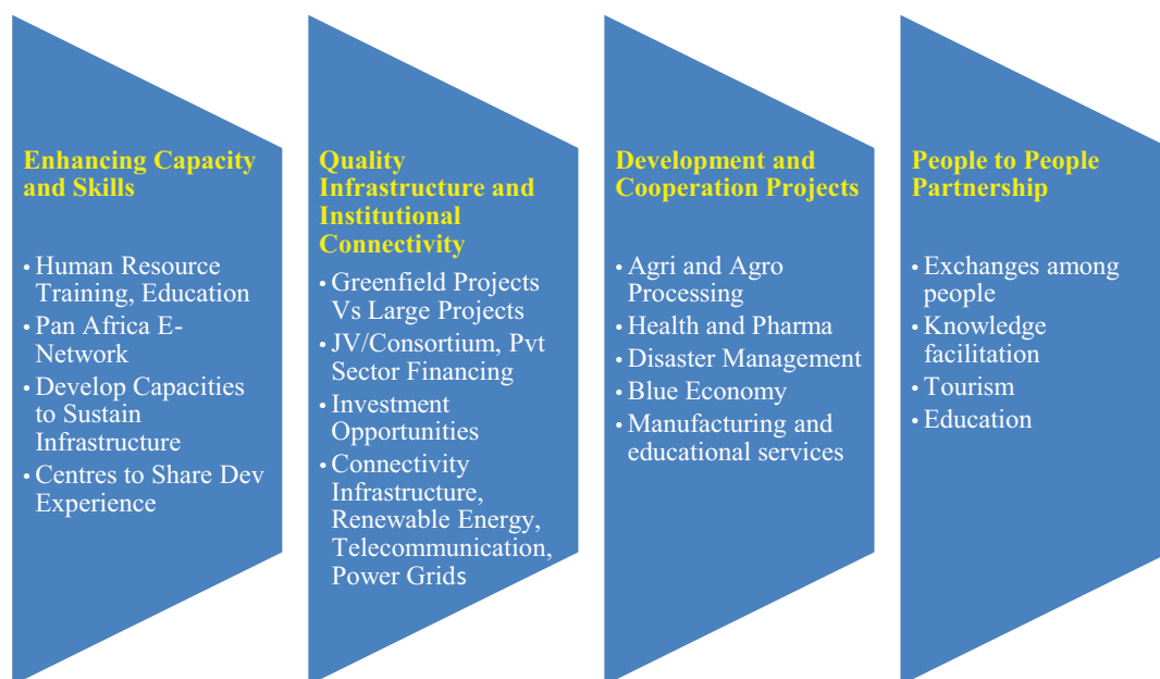
Figure 2: Key Pillars of AAGC

India's initiatives in affordable clean energy ( Pradhan Mantri Ujjwala Yojana (PMUY) ), centralized identification programmes ( Aadhaar ) to facilitate easier identification of potential beneficiaries of development programmes, the Jan-Dhan Yojna , the national financial inclusion scheme which ensures direct financial transfers into the beneficiary's bank account,