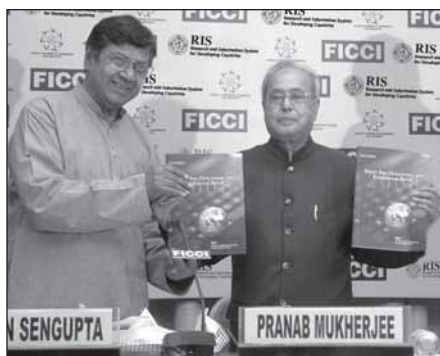
Mr. Pranab Mukherjee, Hon'ble Minister for External Affairs; and Dr. Arjun Sengupta, M.P. and Chairman, RIS launching RIS' South Asia Development and Cooperation Report 2008 at the Regional Conference on Deepening South Asia Economic Integration, organized by RIS, FICCI and the SAARC Chamber of Commerce and Industry in New Delhi on 24 July 2008.