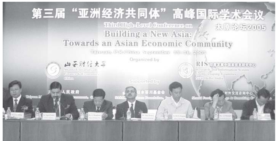
Speakers at the inaugural session at the Taiyuan Conference.