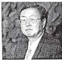
Zhao Xiaochuan Governor, People's Bank of China

It was also pointed out in the opening paper that all entities have perhaps reached their limits, as they are unable to exploit the full potential of growth through the synergy of these economies alone.