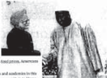
Manmohan Singh with African Union Chairman G8I on the inaugural occasion of India-50th, in New Delhi on Sunday.

Asserting its role as an emerging global power, India today announced duty-free market access to all the 50 least developed countries (LDCs) in the world, the world's poorest.