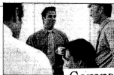
discussing agriculture subsidies. The bet

impossible to accept," the official said. The on-going Doha round, which began in November 2001, is in its sixth year. Some policy watchers feel that the US will not be in a position to make commitments all its presidential elections get over. It may be noted that the Uruguay round, which preceded the Doha round, took eight years to get completed. It will not come as a surprise if the Doha round takes more time to be concluded, as it not only covers a wider stretch of areas, including industry, agriculture, services and rules, but also