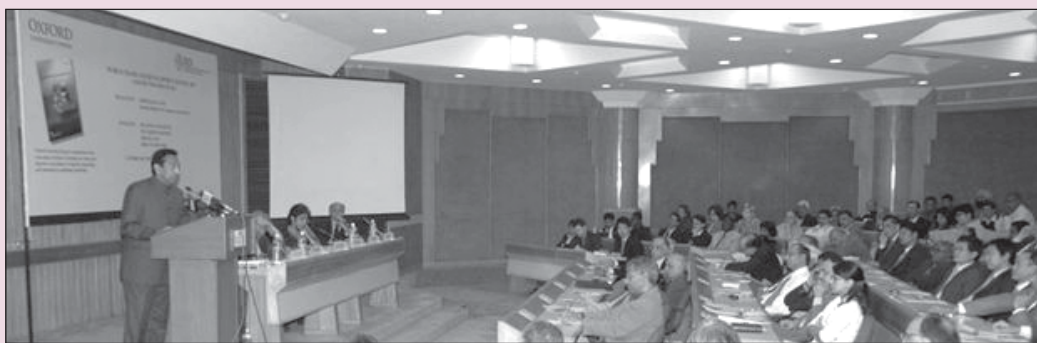
(From left): Hon'ble Mr. Kamal Nath speaking at the launch function of the WTDR 2007.

Mr. Kamal Nath, Hon'ble Minister for Commerce and Industry, launched RIS' World Trade and Development Report 2007 – Building a Development-Friendly World Trading System at a function, organized jointly by RIS and the Oxford University Press in New Delhi on 23 February 2007. The Report, prepared by a RIS team, has been published jointly by RIS and Oxford University Press.