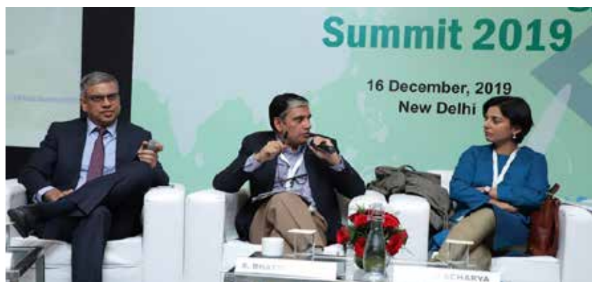
Participants at South Asia Green Energy Summit 2019.

India’s climate leadership balancing energy demands,