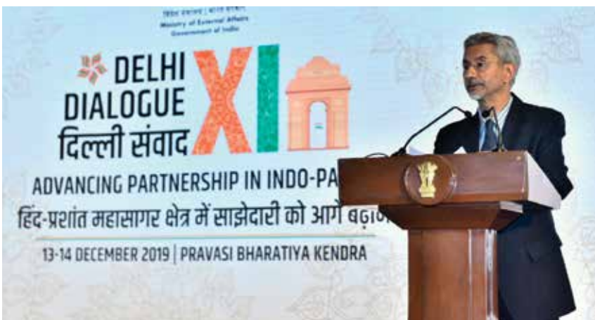
Dr S. Jaishankar, Hon'ble External Affairs Minister delivering the Valedictory Address.