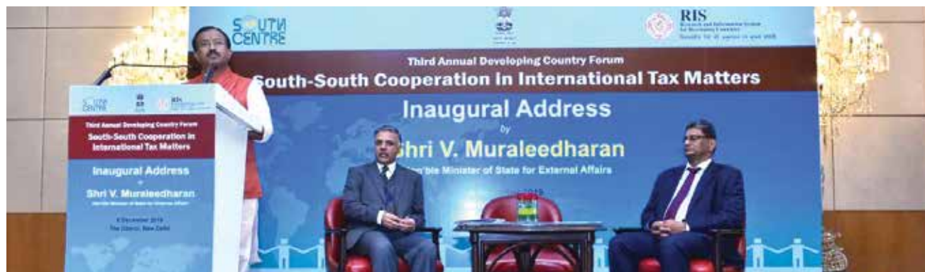
Shri V. Muraleedharan, Hon'ble Minister of State for External Affairs delivering the Inaugural Address.

International taxation issues are among the important policy challenges that developing countries currently face. Besides routine issues of tax avoidance, tax evasion and tax base erosion, developing countries grapple with challenges with respect to digital economy, extractive industries, tax evasion by multinational enterprises, base