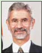
Dr S. Jaishankar Hon'ble External Affairs Minister, India

The original logic of inter-connected maritime space has today reasserted itself, naturally and in an evolutionary manner. Economic and civilisational impulses link the eastern and southern shores of Africa through the Gulf, the Arabian Sea island nations, the Indian subcontinent, South-east Asia, Australia, New Zealand and the Pacific islands. We can certainly say that this is the way it has always been in our region. And perhaps this is as it should be. While there may be a multiplicity of views on the Indo-Pacific and all that it contains, there is everything to gain by engaging with this concept, and trying to build the idea outward as we go.