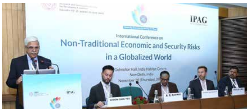
Participants at inaugural session of the conference.

RIS, in partnership with the The Institute for Policy, Advocacy, and Governance (IPAG) Asia Pacific organised an International Conference on ‘Non-traditional Economic and Security Risks in a Globalized World’ on 28 November 2019 at New Delhi. The Conference brought together subject experts from the non-traditional security and economic landscapes to deliberate on the multitude of economic and security threats confronting the global community and had come up with policy strategies and options to address them. The programme included the following sessions: Environmental & Energy Security; Migration; Business Session; Impact of Trans-