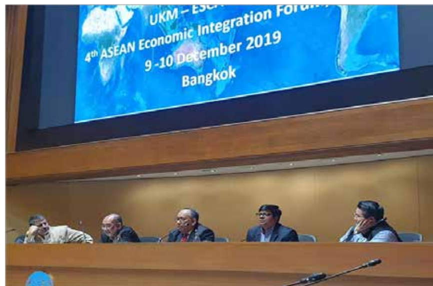
Session on ASEAN in the Indo-Pacific, Opportunities and Challenges for Future Economic Development' at UNESCAP, Bangkok.