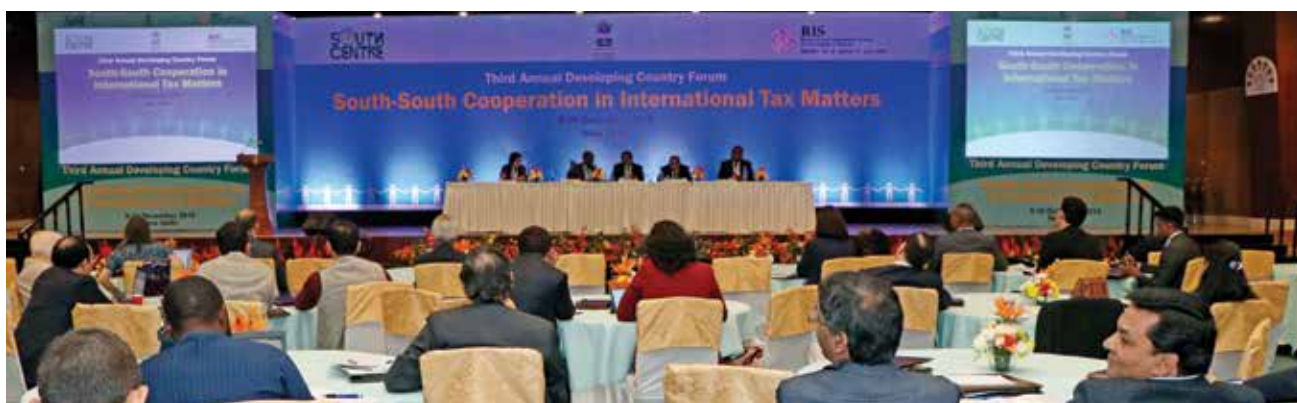
Session in the progress.

The Forum deliberated on a wide range of issues relating to core areas of taxation as well as the emerging fields like digital economy and services. In view of