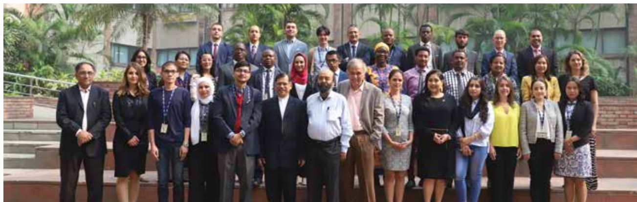
Participants with the RIS faculty.

experts to give a comprehensive perspective on these issues for the benefit of participants. The report entitled "Global Issues and Local Actions in South-South Cooperation" prepared by the participants was also brought out.