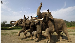
Sumatran elephants downgraded to "critically endangered" in Indonesia