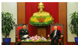
Chinese state councilor meets with Vietnam's communist party