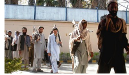
Taliban fighters attend surrender ceremony in eastern Afghanistan