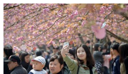
People view cherry blossoms at university, E China