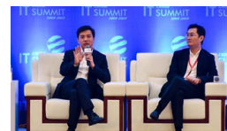
China (Shenzhen) IT Summit takes place in S. China