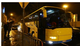
Delayed Chinese passengers depart from Brussels