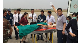
China sends plane to take home 6 nationals injured in Laos attack