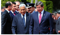
Jordanian PM Ensour welcomes Turkish PM Davutoglu in Amman