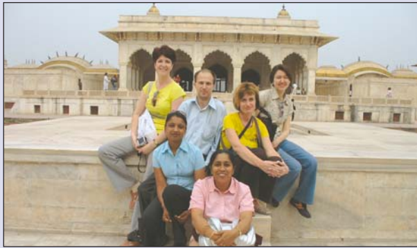
Participants take a break for site-seeing.